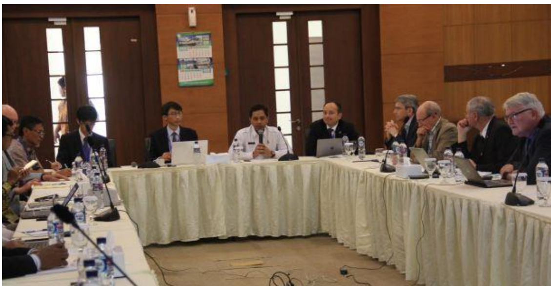
Figure 4. Joint Meeting of RA II and RA V conducted at BMKG Headquarter, Jakarta

The Joint Meeting of RA II WIGOS Project and RA V TT-SU for RA II and RA V National Meteorological and Hydrological Services (NMHSs) in Satellite Data, Products and Training was held in Jakarta, Indonesia, on 11 October 2018, attended by 45 representatives from 31 countries of RA II and RA V member, and representatives from EUMETSAT and WMO. There were several reports made during the meeting, include the following: