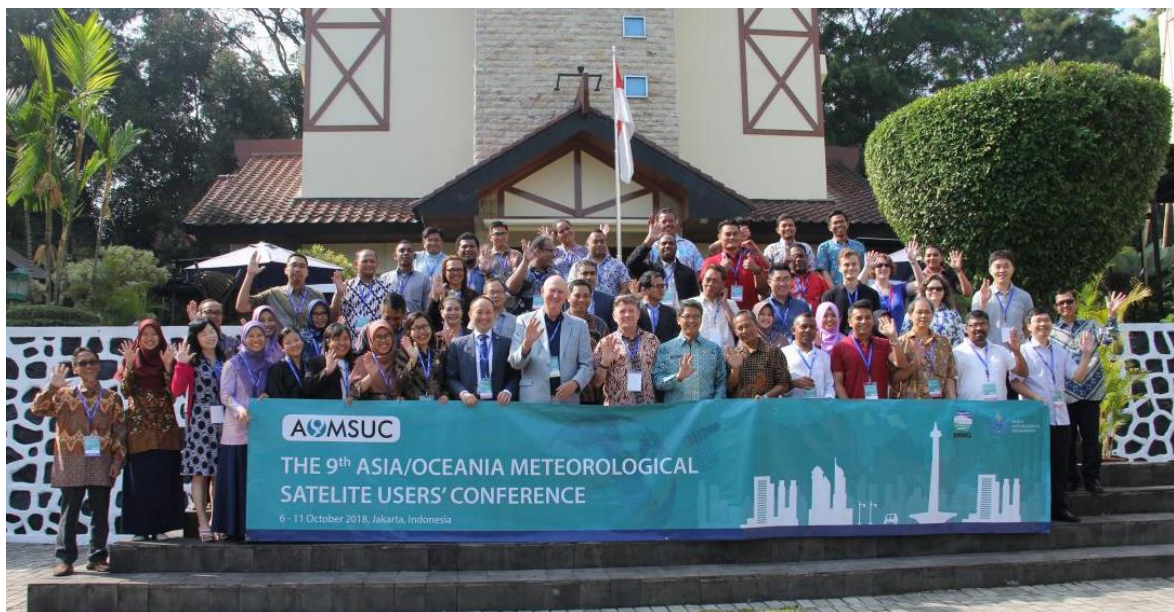
Figure 2. Participants and Lecturers of the AOMSUC-9 Training Session in front of the BMKG Indonesia Training Campus in Citeko, Bogor.