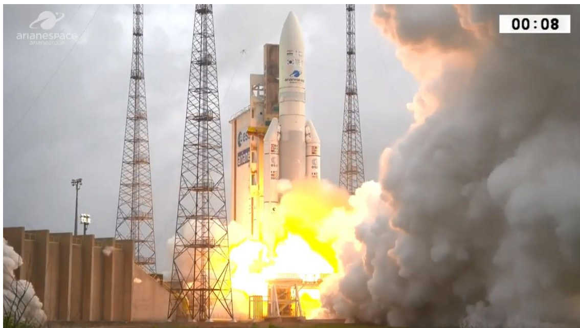
Figure 1. GEO-KOMPSAT-2A successfully launched

oping cumulonimbus and volcanic ash clouds. (Dohyeong Kim, KMA)