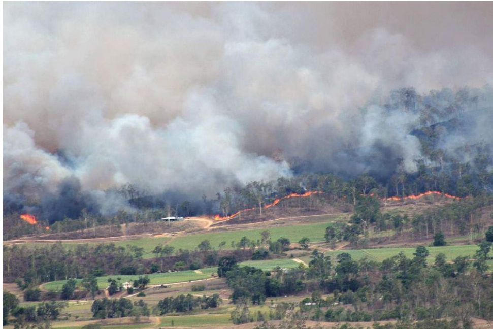
Figure 6. The Finch Hatton fire front approaching Eungella Mountain Edge Escape in north Queensland. Around 110,000 hectares of Eungella National Park was destroyed and will take hundreds of years to recover.